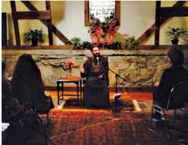
Unfolding the Message Online Series, Fall 2015.