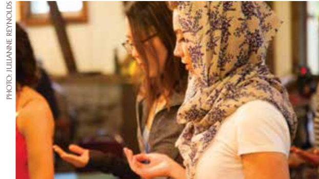
Way of Illumination, May 2015

To encourage participation by New Yorkers, free transportation was offered from the Metro-North Station in Wassaic, New York, to the Abode. Eight people accepted this offer. Overall, 59 people participated in the program, including 36 people either brand new or having been introduced to Sufism within the previous two-years, 13 long-time initiates, five mentors supporting program participants, and five people on the event's tech team. Twelve people took initiation the program's last day.