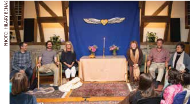
Season of the Rose, July 2015